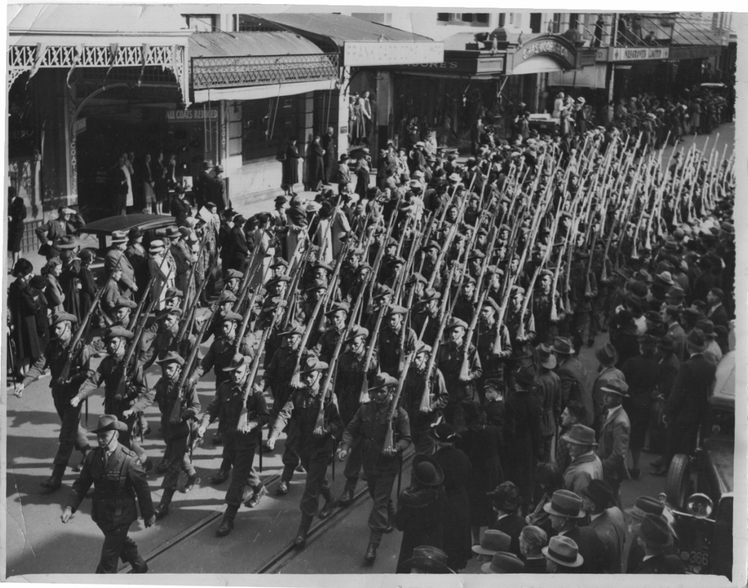
B Coy 11 Militia Bn Marching Down Murray St, Perth

When I got into the AIF the Store did not have a hat big enough, or boots small enough for me. I take a size 5 in boots and a 7¼ in hats. As I still had my Militia boots and hat I was allowed to wear them. Going out on Parade, when the old Warrant Officers conducting the parades wanted a marker they spotted my old, well broken in hat so I was made marker.